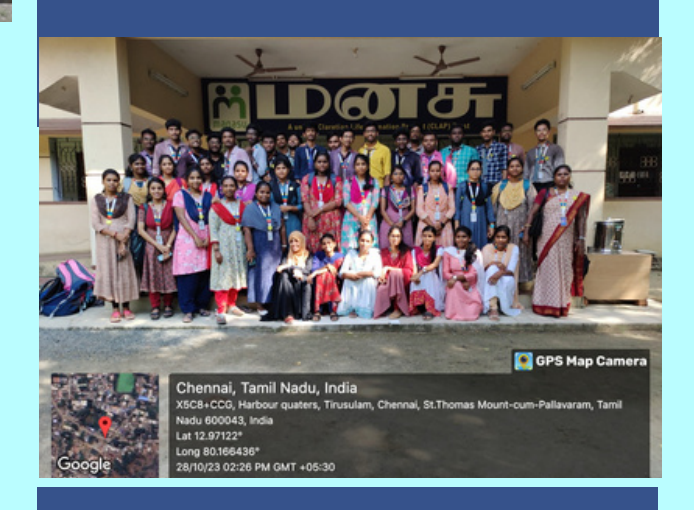
4/11/2023 – WEBBS MEMORIAL ORPHANAGE

I MBA student went to orphanage house and engaged them with games like musical chairs, dance, etc., The students also played sports with them like cricket, throw ball,etc.